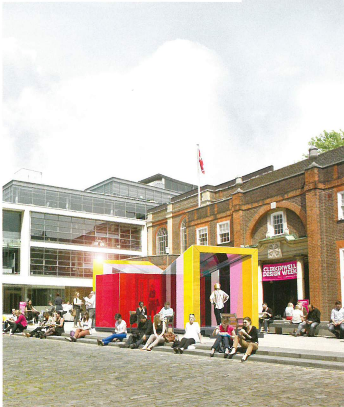
Cousins & Cousins has revealed its designs for the pavilion it will create on St John's Square for Clerkenwell Design Festival 2015 (19-21 May). The pavilion, named 'Glaze', is constructed from coloured panels of glass, alternating between transparent and opaque.