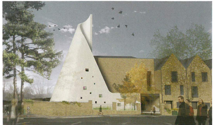
Theis + Khan has won planning permission for a church-cum-housing development in Watford. The building, which will be clad in ceramic tiles, references 'religious scrolls and Watford's history as a paper-making centre'.